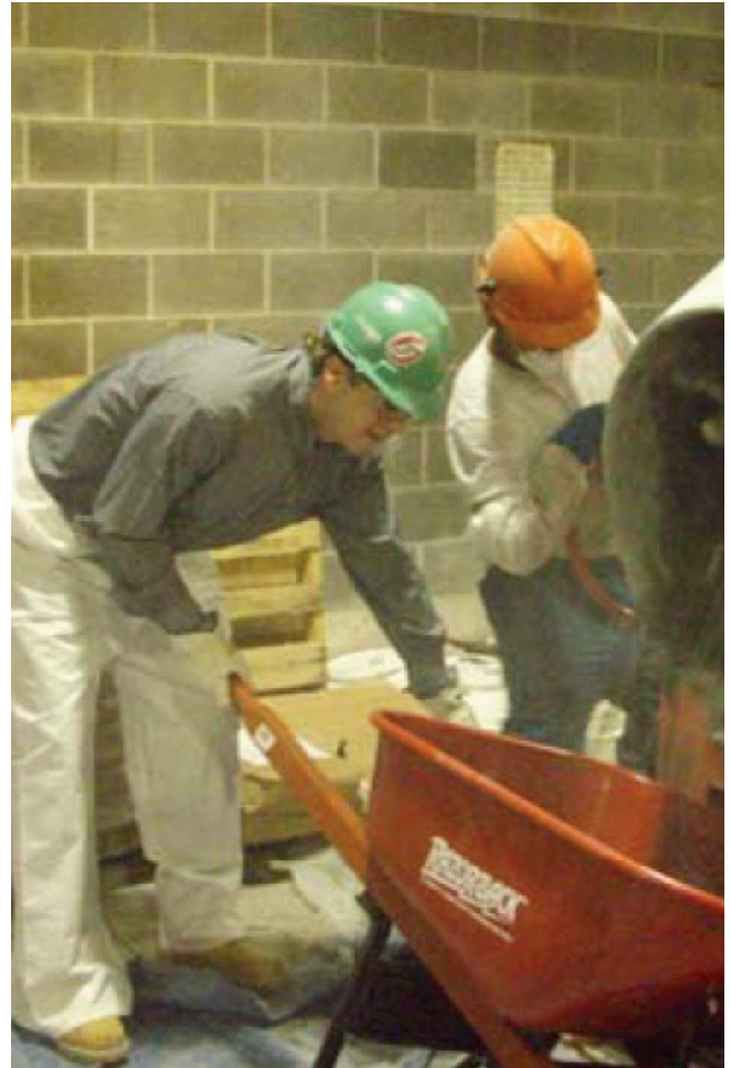
2. Mixing Tufchem Silicate Concrete

After over 15 years of service, TUFCEM Silicate Concrete had out-lived every other refurbishment material tested at the mill and was chosen again for additional renovations undertaken in 2007.